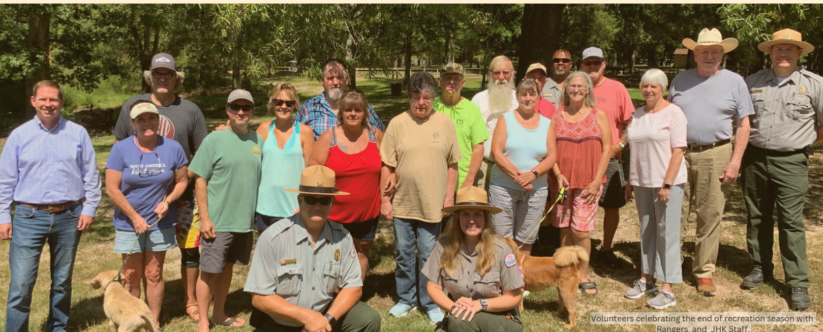
Volunteers celebrating the end of recreation season with Rangers and JHK Staff.

TRAINING WILL INCLUDE ANNUAL ORIENTATION AND ON THE JOB TRAINING.