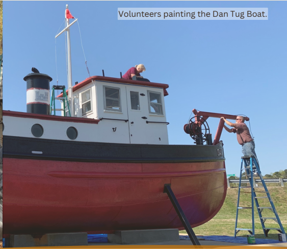
Volunteers painting the Dan Tug Boat.