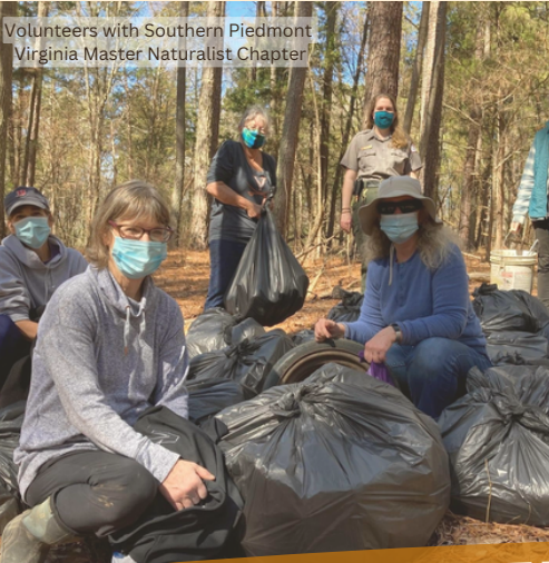
Volunteers with Southern Piedmont Virginia Master Naturalist Chapter