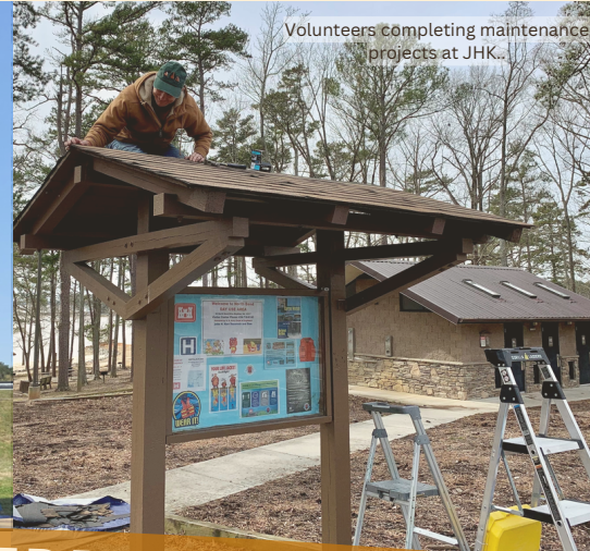
Volunteers completing maintenance projects at JHK.